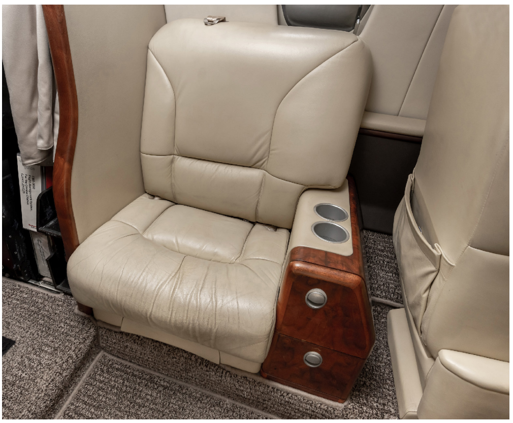
Specifications and/or descriptions are provided as introductory information only, and do not constitute representations or warranties of Pinnacle Aviation. Accordingly, you should rely on your own inspection of the aircraft. Subject to prior sale.